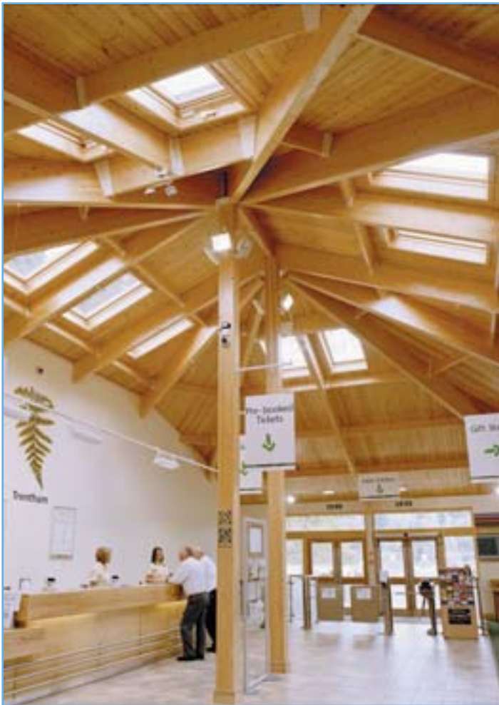
The open vaulted roof of the visitors centre.

The visitor centre combines environmentally friendly architecture with stylish practicality. It is an eight sided, cone shaped timber building with an overhanging roof, supported by three timber columns.