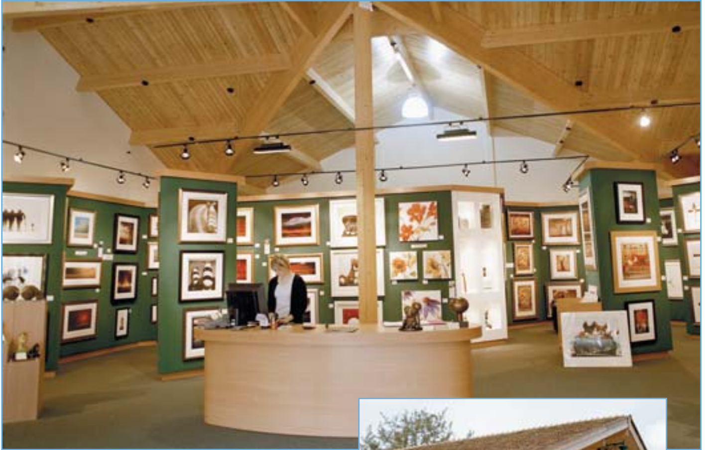
An example of one of the retail units.