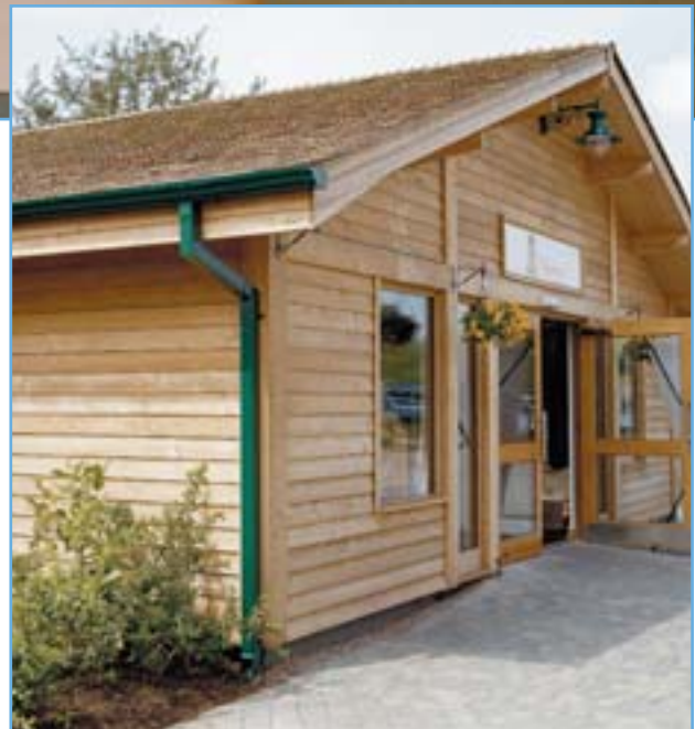
Front elevation of one of the retail units.