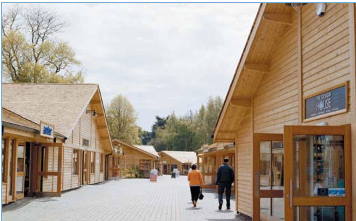
Retail units laid out in a 'village' arrangement.