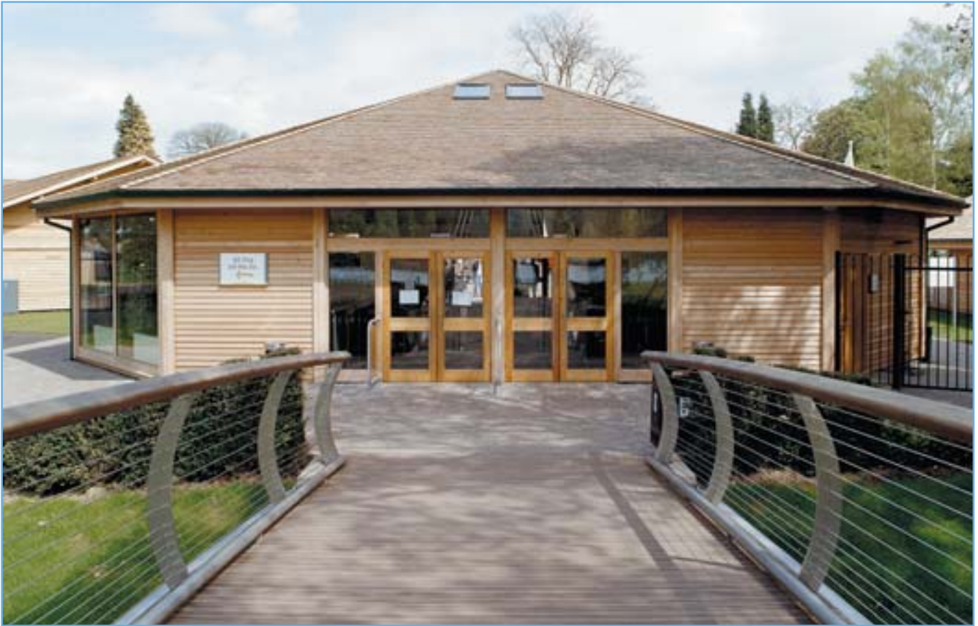
Visitor centre viewed from the bridge into the Gardens.

All buildings are wheelchair friendly having wide access doors, modified WCs etc.